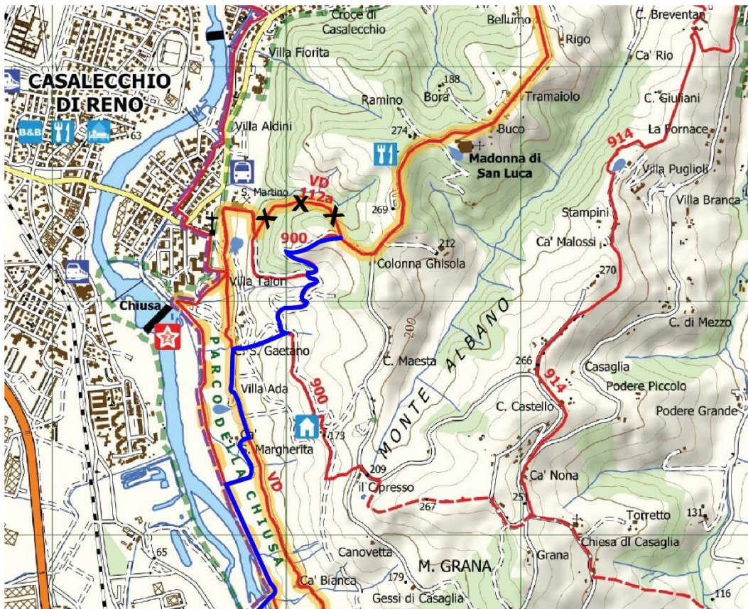
Image 1 - Bregoli variant - CAI path 900 Parco Talon

(marked in BLUE on the official map image1).