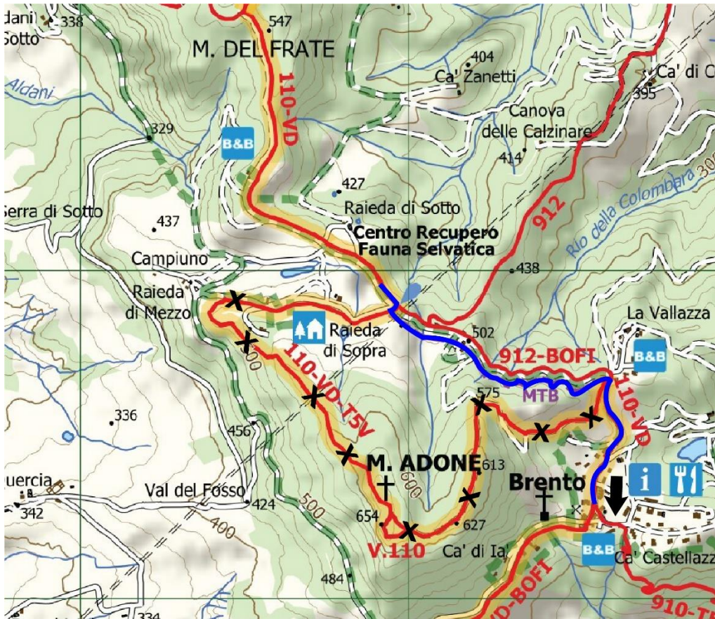
Image 4 - Monte Adone, MTB variation

The loop going up to Monte Adone is interrupted by a large landslide and is not possible now to climb the top of the mountain.